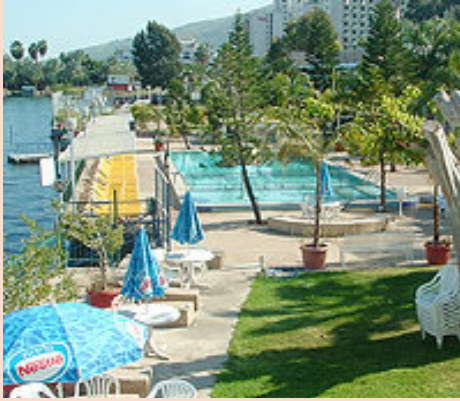
Ron Beach hotel beside the lake

Please ensure that your passport is valid for at least six months after the time of this pilgrimage. If you need a new passport apply early as there can be considerable backlogs at the passport offices. A visa is issued free of charge on entering Israel and there are currently no further requirements for entering the Palestinian territories. If you are holding a non-British passport, or require further advice, please consult the McCabe office. No inoculations are required. We, however, do advise you to consult your doctor regarding your own personal requirements.